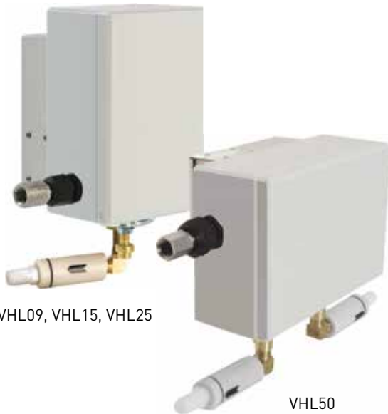
VHL09, VHL15, VHL25